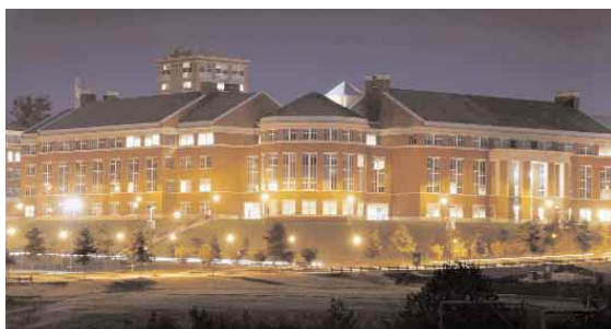
▲ A day shot and night shot of the James H. and Martha H. Woodward Hall.